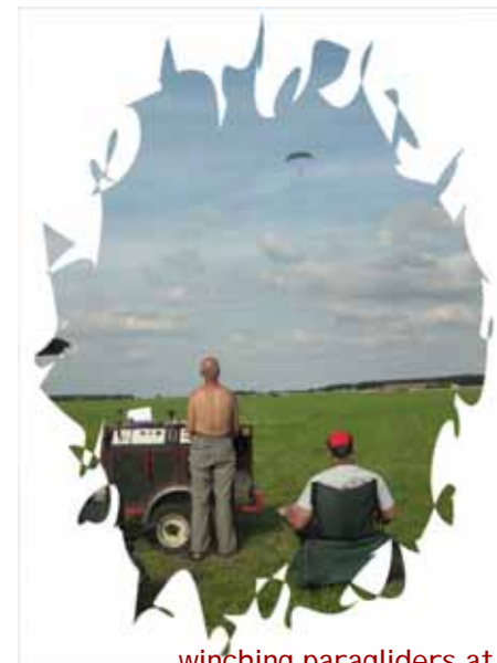
winching paragliders at Luffenham